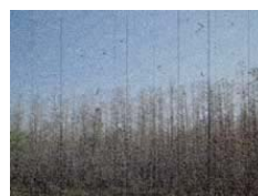
Carolina Sardi Hasta q te des Cuenta Single Channel Video Projection DVD, 2:30" loop 2006/Edition of 3