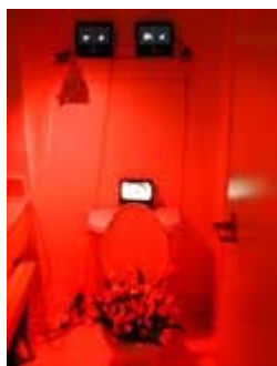
Pablo Lopez Toilet Feed/Toilet Feedback Installation at DiVA NY 2006 Single Channel Video Projection, Flash Animation DVD, 2006/Edition of 5